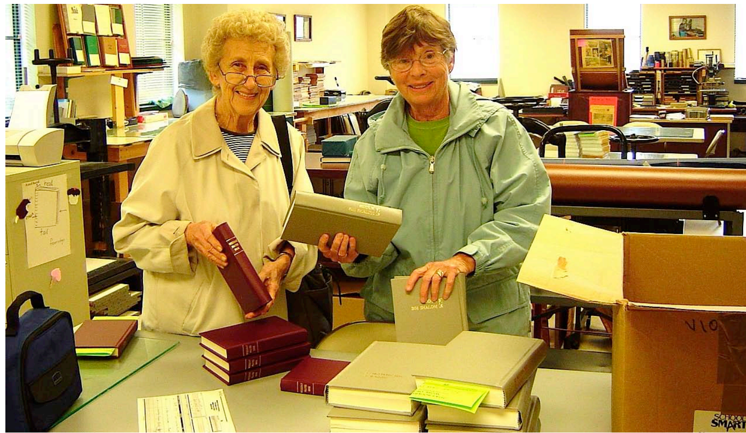
Pleasure and pride in a job well done are obvious on the faces of these volunteers at MYRIAM'S DREAM BOOKBINDERY in Atlantic City, where school texts, religious and other books are restored. Clients and visitors are always welcome!

You, too, might be interested in volunteering to help us continue our work. We are thrilled when volunteers and board members are able to visit the organizations we support. Those visits also can make your travels much more meaningful. If you are interested in becoming involved, please contact Linda Kantor at LSKANTOR@snet.net or 203-795-4580.