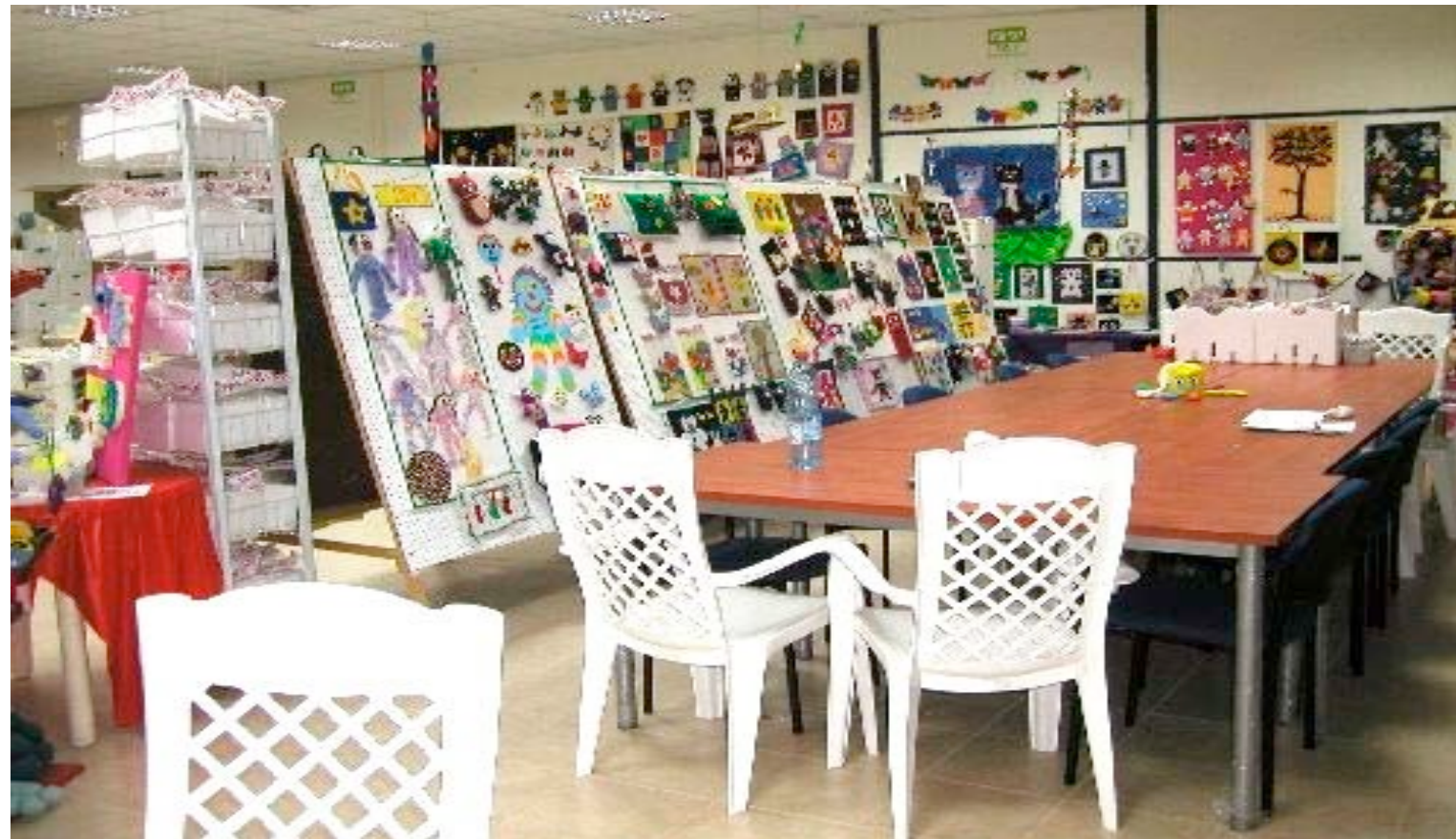
Toys and puppets for homebound children, shelters and hospitals are created by the elders at CLICK, a workshop just north of Tel Aviv. If you're "in the neighborhood", stop in for a visit.