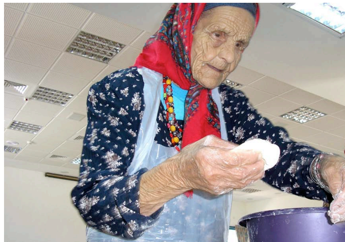
An Israeli elder at Mate Yehuda teaches and cooks an ancient recipe.